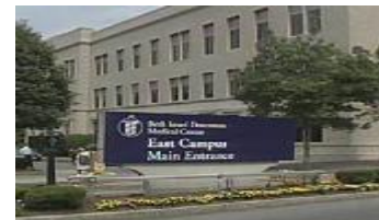
Beth Israel Deaconess Medical Center