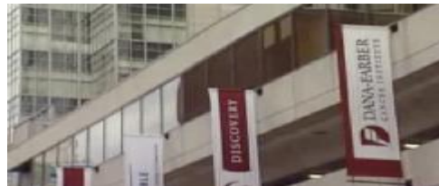
Dana-Farber Cancer Institute