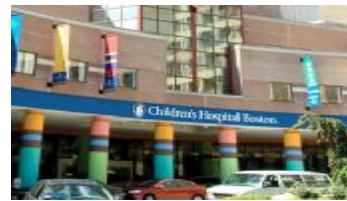
Children's Hospital Boston