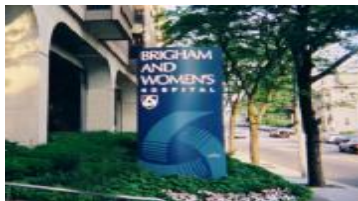
Brigham and Women's Hospital