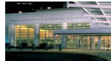
Massachusetts General Hospital